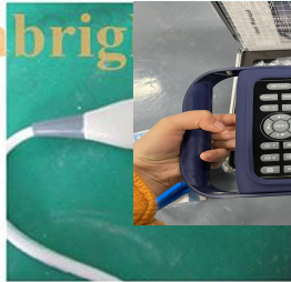
3.5Mhz cardiac probe