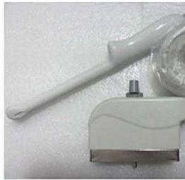
6.5Mhz transvaginal probe