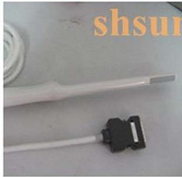
5.0Mhz rectal probe