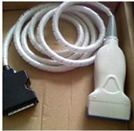
7.5Mhz linear probe