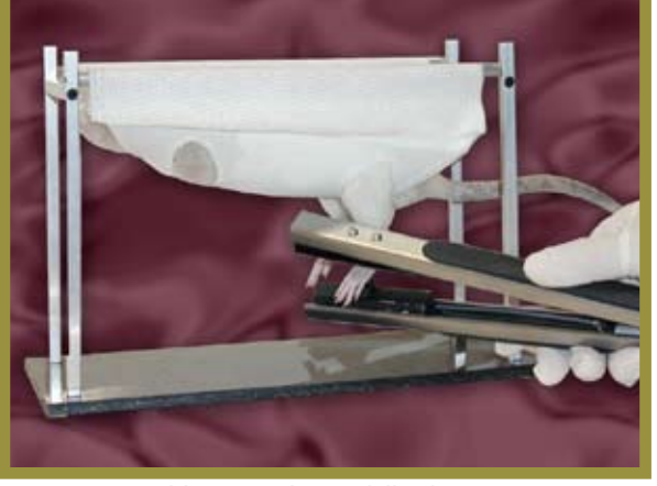
Sold separately-Randall Selitto test

Order any one of the test systems complete and the only additional item(s) needed are the individual modules to perform each test.