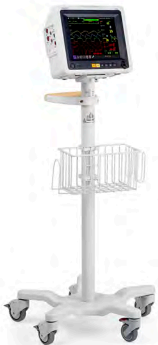
GCX Roll Stand 989803172771