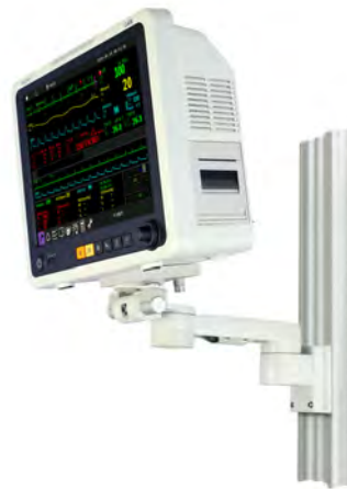
GCX Wall Mount 989803172761