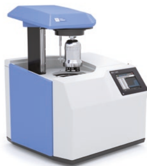
C 6000 Oxygen bomb calorimeter Ident-Nr. 008804300

If required, the following IKA devices are available for your lab to enhance tempering using the Oven 125 basic and control: