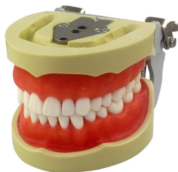
32 screw-in teeth jaw model with soft gingivae