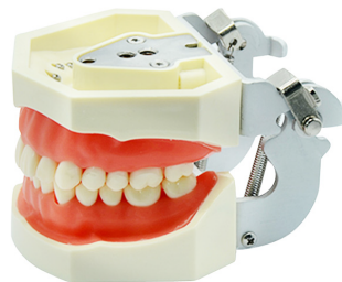
24 screw-in teeth jaw model with soft gingivae