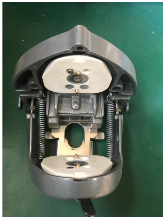
Phantom head, upper base plate, phantom mask, lower magnet plate, made of ABS plastic with aluminum frame, magnetic jaw model mounting system, adjustable jaw opening up to 45°, head position lock/release screw