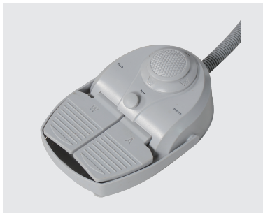
Multifunctional Foot switch