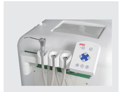
High speed handpiece tube Low speed handpiece tube 3-way syringe