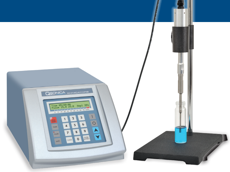
Stand sold separately.